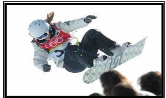
Torah Bright – Snow Boarding Women's Halfpipe